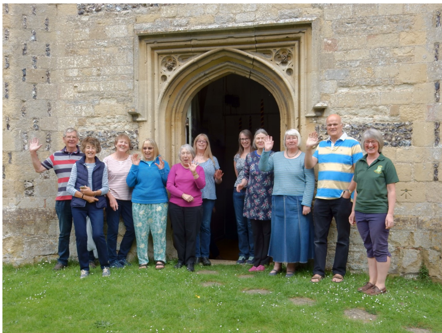
Wednesday afternoon outing —24th April 2019

In this issue: Editorial 2, Chairman's Report 2, Secretary's Report 3, Ringing Masters' Ramblings 4, Tower Talk 5, New Years' Day 2019 photos 13, ONB 10-bell Striking Competition Band photo 14, Young Ringers' Outings 14, Young Ringers' Fest 17, Branch Ringing School LTR1 Course 19, LTR2 Certificate presentation 20, ART Awards 20, ART Module 2F Poster 21, Clock Puzzle 22, Presentation of Striking Competition Trophy 23, Quarters 24, Peals 25, Branch Outing Programme 28, BBQ Poster 29, ONB Branch Programme 30, ONB Website 31, Contact List 31, Copy date for the next issue 31, Striking Competition Team photos 32.