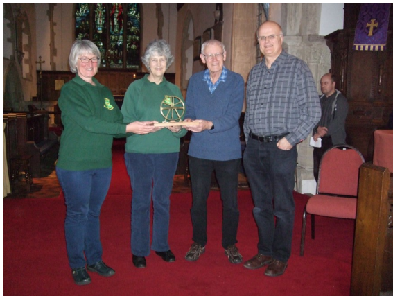
Presentation of Striking Competition Trophy to Abingdon

Answers will be given in the next issue.