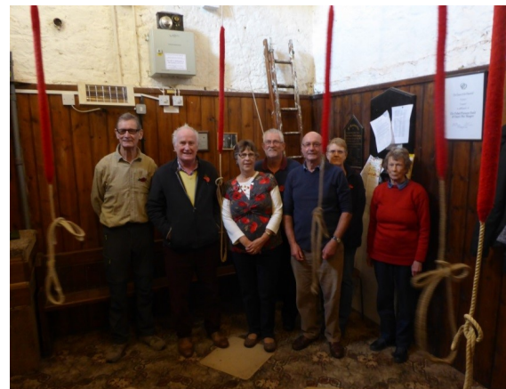
Some of the Sunningwell band.