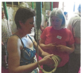
Working in pairs on an ART course