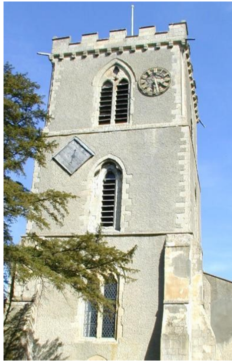
D: Tower with 2 different clock faces.

Answers will be given in the next issue.