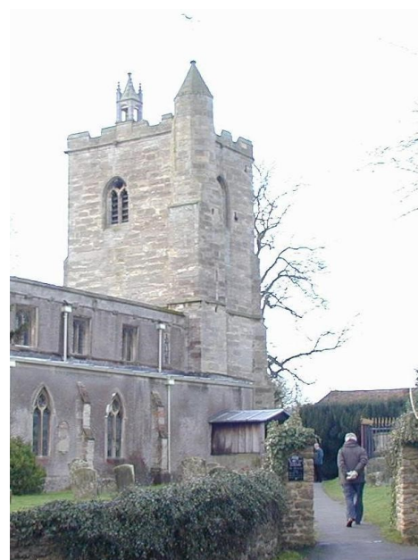
A: Clock without any external face.