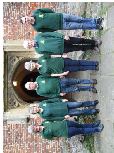
Abingdon 'B' - The Winners