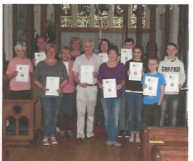
The Maids Moreton band with their LtR Level 1 certificates & teacher accreditations