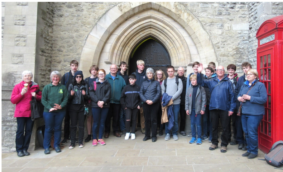
The group outside Carfax Tower

While the Old North Berks branch holds little outings for young ringers each school holiday, this time we decided to be more adventurous and organise a big day out especially for young ringers in the whole Guild. Visiting Oxford was an ideal choice.