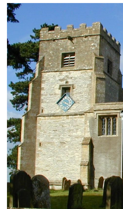
B: Clock with one face with only one hand.