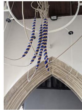
The new ropes.

I rang for both Remembrance Sunday and 11 th November, just one bell normally for a few minutes before 11am then two minutes silence followed by 40 bongs for the number of fallen. Apparently men digging their allotments heard the bell and stopped their digging for the two minutes, the bell could be heard down as far as the War Memorial.