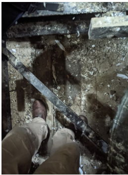
The pigeons left the bells looking like this!

Just before Lockdown 2, our lovely new ropes arrived and were hung (if that is the right word) by Nick and Nicola with Colin orchestrating things below. Whilst they were up with the bells, Nick and Nicola cleared up not only the pigeon poo but several bags of other detritus including the remains of old muffles. I had the job of clearing up the mess below when they had finished.