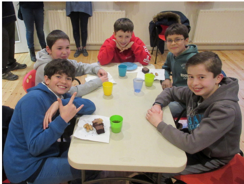
Photo taken at the Young Ringers Outing on 2 January 2020 (see p.17)