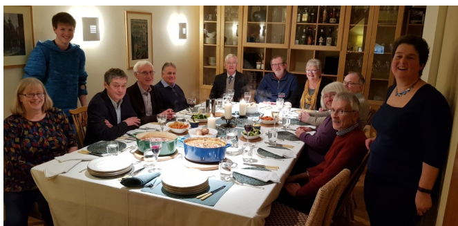
The Westminster Abbey Company of Bellringers