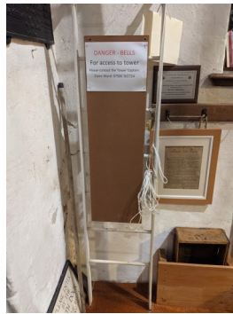
The blocked off ladder.