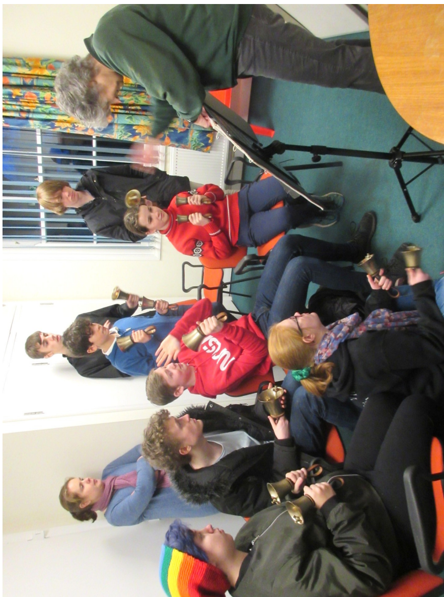
Photo taken at the Young Ringers Outing on 2 January 2020 (see p.17)