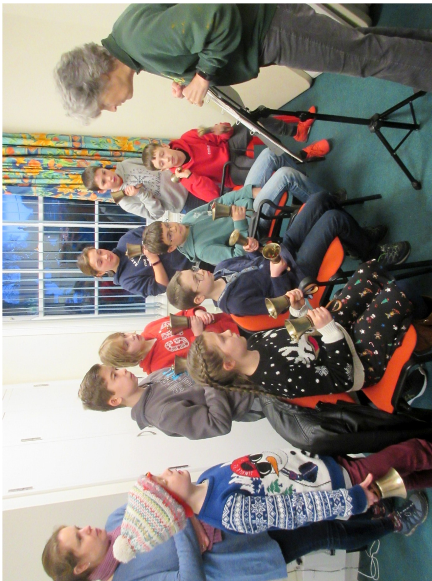
Photo taken at the Young Ringers Outing on 2 January 2020 (see p.17)