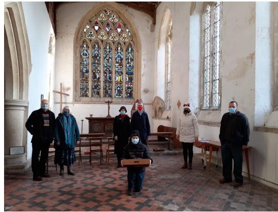
The band that rang on Christmas Day.