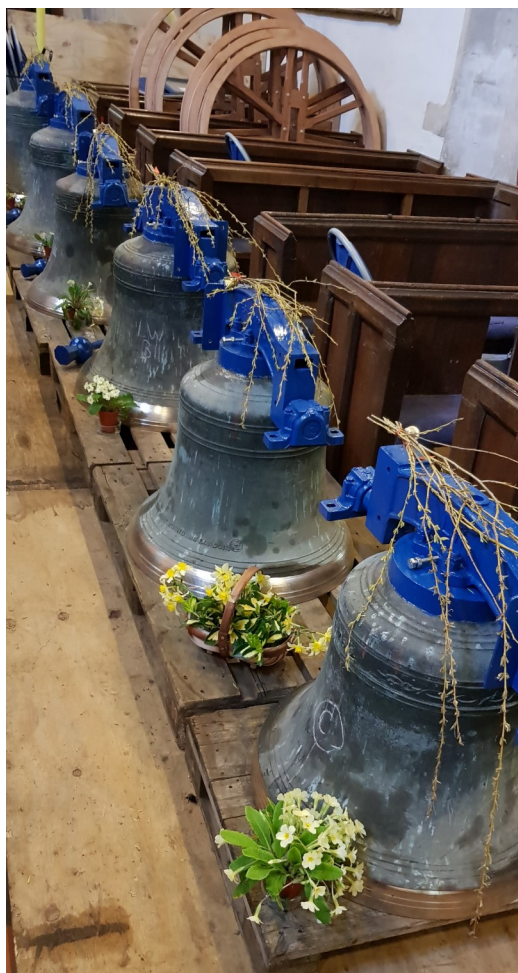
Long Wittenham bells on display before rehanging