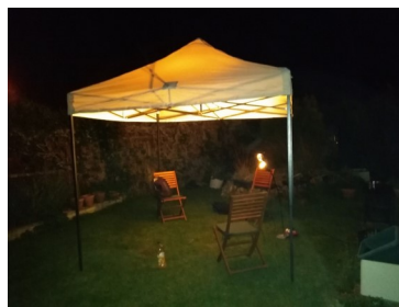
“Botley Cathedral” lit up.

Although most of the virtual quarter peals are not reported in the newsletter (they can be found at https://bb.ringingworld.co.uk/event.php?id=13204 for 2020 and https://bb.ringingworld.co.uk/event.php?id=13413 for 2021).