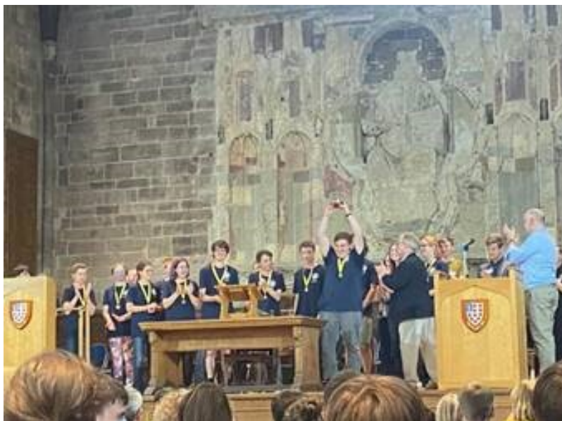
The Team receives the Whitechapel Trophy for a second year.

Many congratulations to this year's team and I hope the team for next year will be able to make it a hattrick.